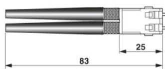
SCRJ plug connector, POD, IP20